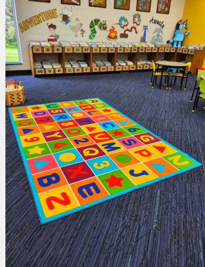
New Story Time Rug at the Webster Memorial Branch!

Interested in joining the Friends of the Van Buren District Library, Friends of the Antwerp Sunshine Library, or Friends of the Lawrence Library? Visit VBDL's website for more information!