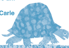
A tortoise, tired of being slow, impatient to get up and go.