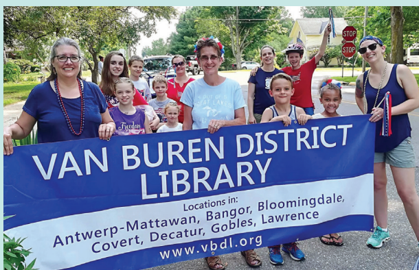
We participate in community events!