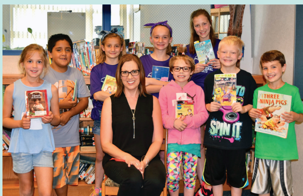
We collaborate with area schools!