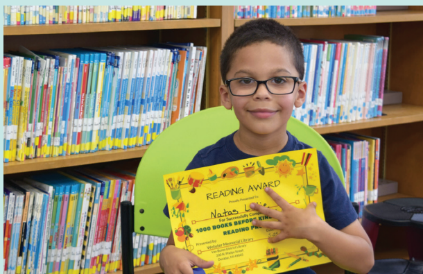
We read 1,000 Books Before Kindergarten!