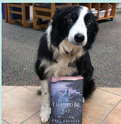
We bring talented authors to the District!