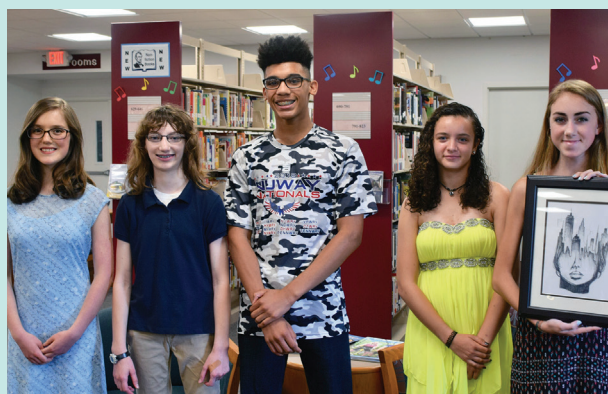
We support the Teen Creative Writing Challenge!