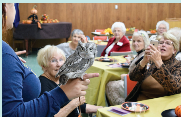
We provide education for all ages!