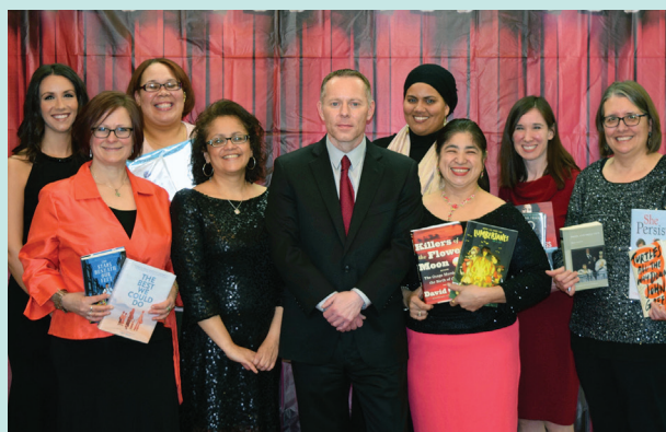
We have a happy, helpful staff!