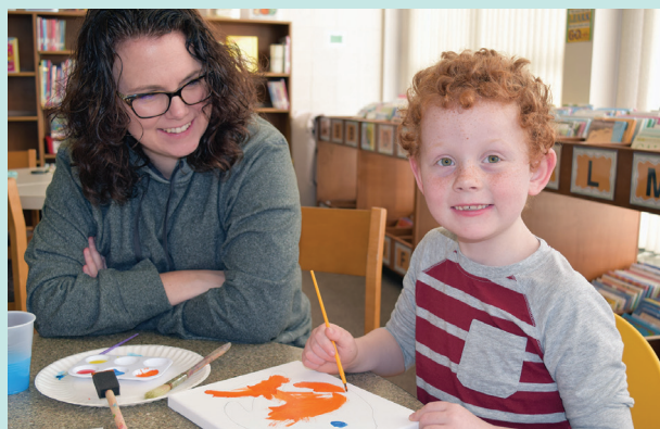
We create art!